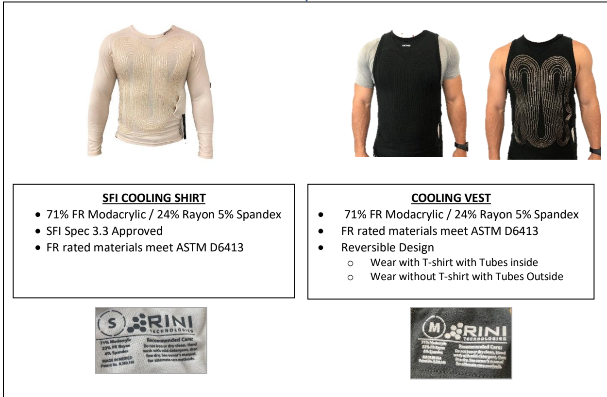
Figure 1: RINI Cooling Garments