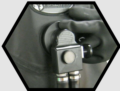
Quick disconnect & drysuit penetrator