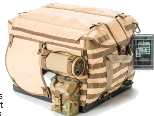
Heat Ailment Recovery Pack

The HARP will provide mounted and un-mounted units in the field with the capability to safely store and transport at least 15 bottles of water in ice as well as a smaller removable bag, which contains a small amount of additional potable water and any medical supplies. The HARP also contains an onboard solar recharge capability and runs off the standard Military BB2590 battery. The system also features integrated straps for tie-down, remote monitoring and remote operation (on/off), and a newly developed polychromatic coating which reflects infrared radiation to increase performance. The system's inner bag is also capable of being removed, worn like a backpack or attached to a separate pack and run independently of the larger outer bag.