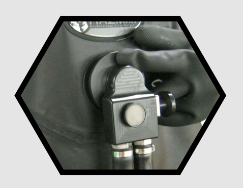
Quick disconnect & drysuit penetrator